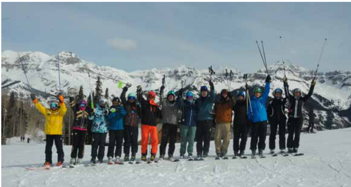
Telluride Trip 2024