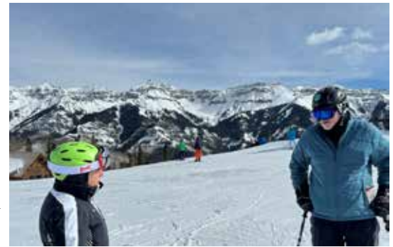
Bet and Dan try to figure out a lesson plan for their unruly students!

Betty Mostachetti and her two sisters opted for a larger (3-person) room. Thanks to them for making their place available for our fun, lively and loud get togethers. We had other hotel dwellers asking if they could crash our next party! Without a common meeting room, we also took advantage of meeting at their two centrally located hot tubs.