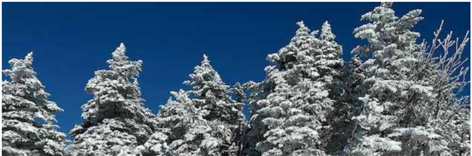
Beautiful bluebird days at Stowe!