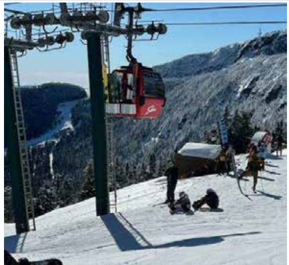
More of the beautiful Stowe trip!