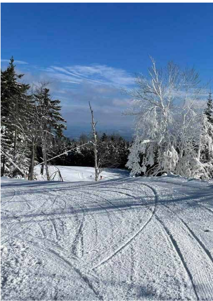
Herb Eschbach captures early season (November) photos from Gore Mountain!