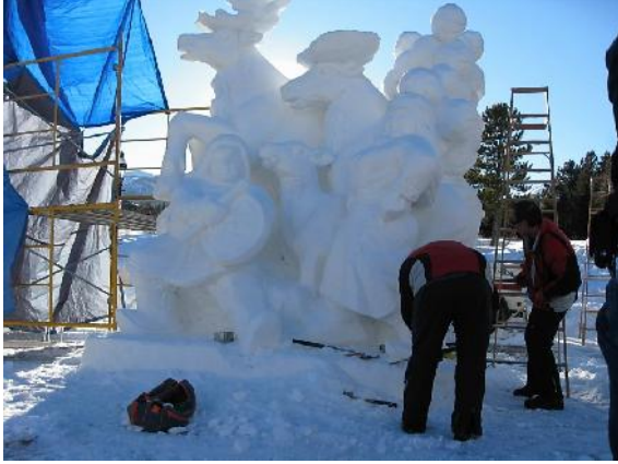
Hudson Valley Ski Club at Breckenridge in 2010