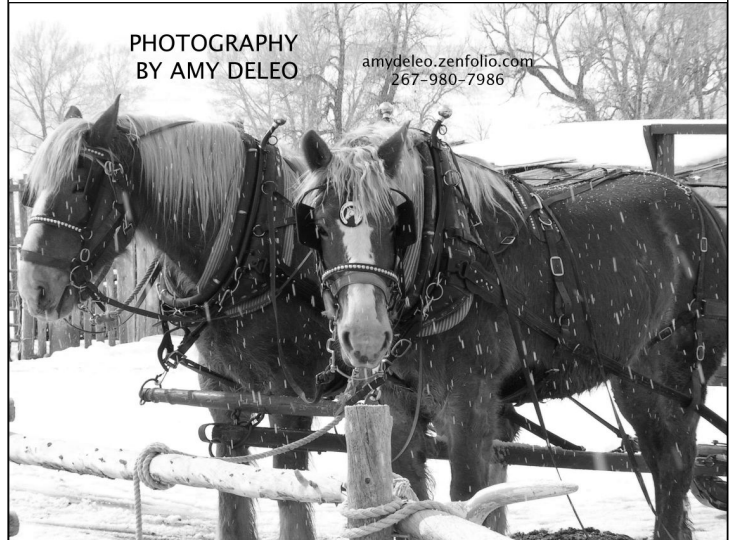
PHOTOGRAPHY BY AMY DELEO

PHOTOGRAPHY BY AMY DELEO amydeleo.zenfolio.com 267-980-7986